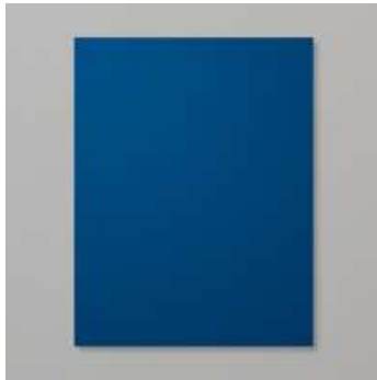
Night Of Navy 8-1/2" X 11" Cardstock #100867