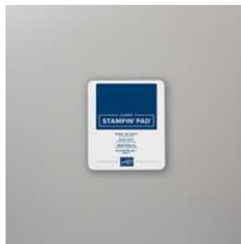
Night of Navy Classic Ink #147110