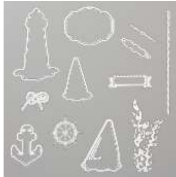
Smooth Sailing Dies #149576