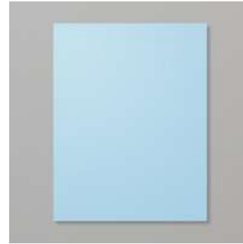
Balmy Blue 8-1/2" X 11" Cardstock #146982