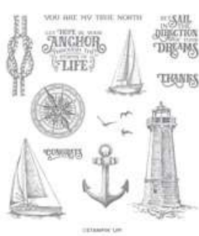
Sailing Home Cling Stamp Set#149457