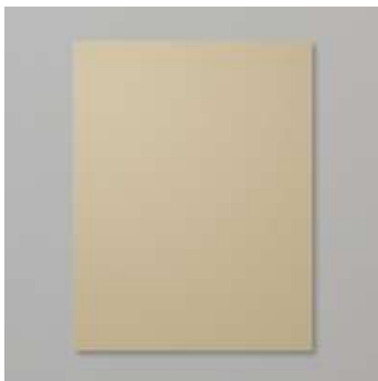
Crumb Cake 8-1/2" X 11" Cardstock #120953